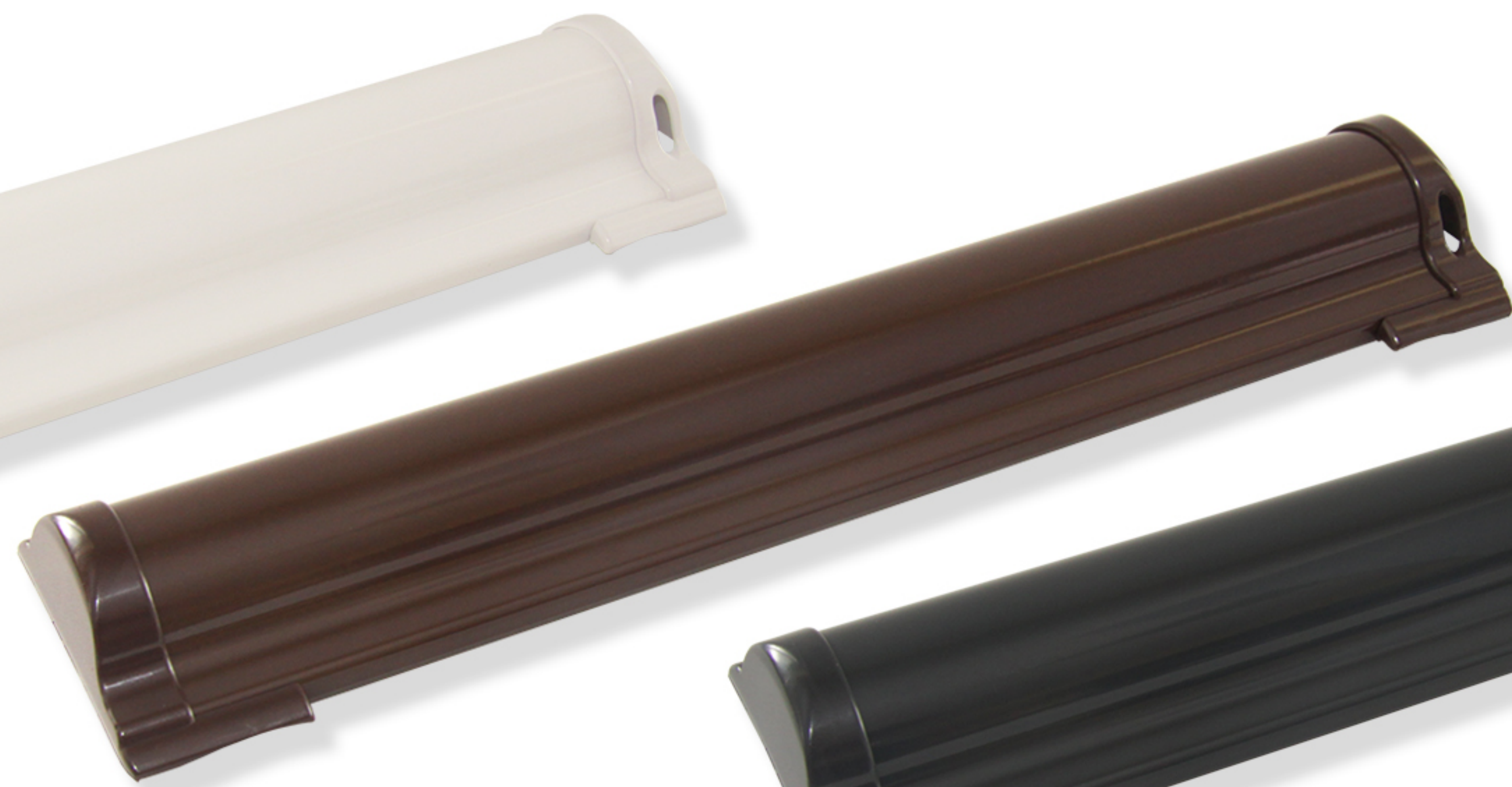
brąz (RAL 8017)