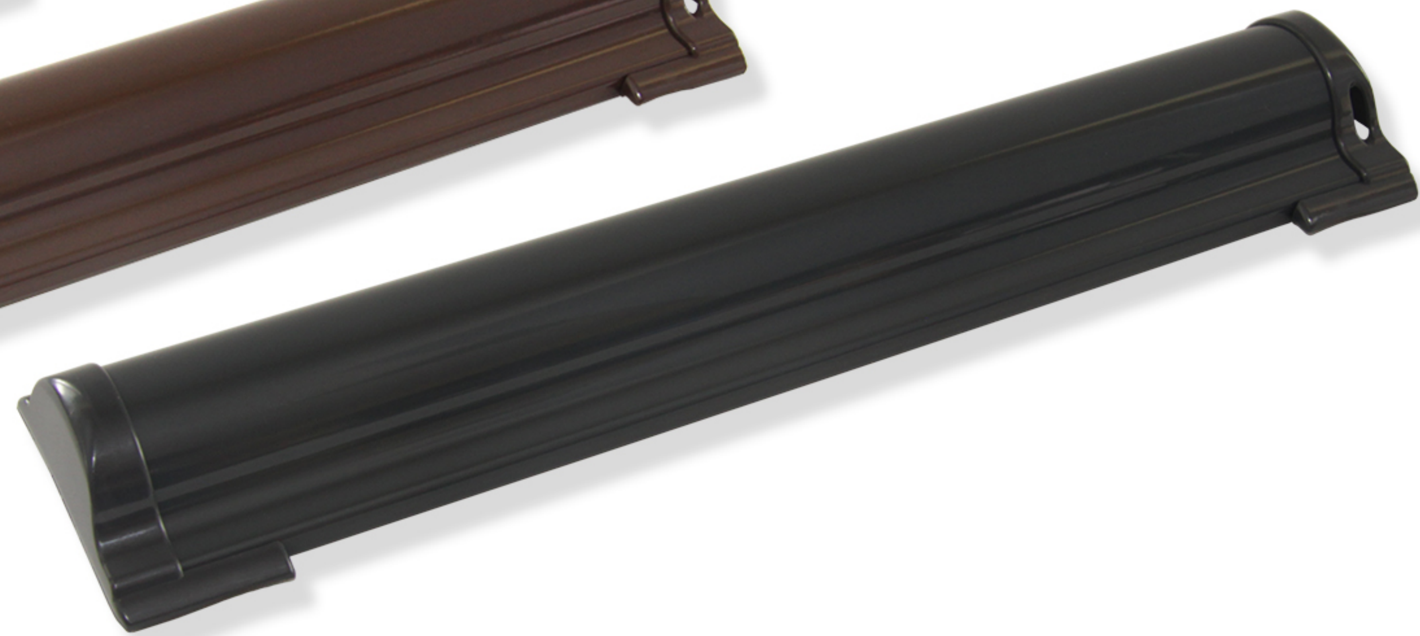
antracyt (RAL 7016)