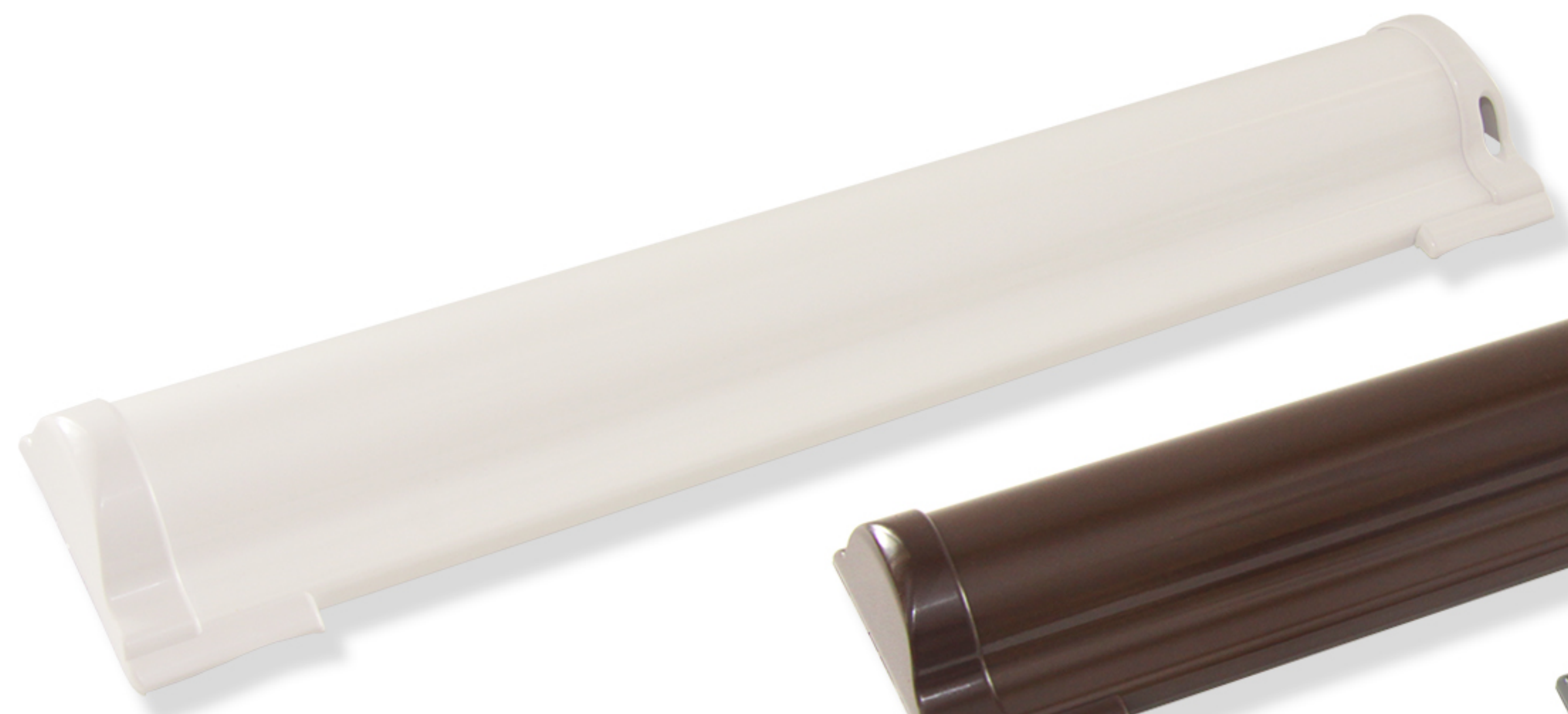
biały (RAL 9003)